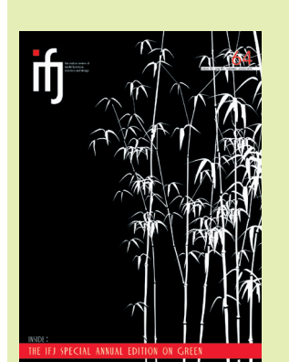
cover concept : sylvia khan